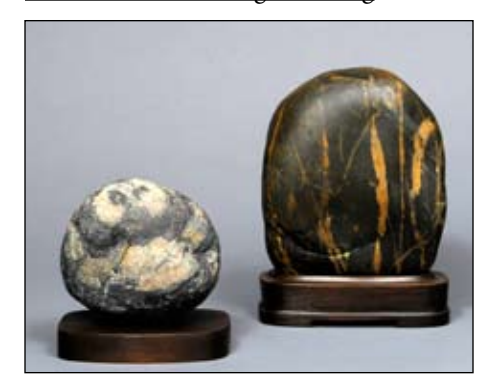
"Panda & Bamboo"—Embedded-image Stones-Oceanside, California/Merced River, California.

If you can't make it to the exhibit itself, photos of the stones will be on the NBF website after the exhibits opens. Please see them at <a href="http://www.bonsai-nbf.org/site/exhibits.html">http://www.bonsai-nbf.org/site/exhibits.html</a>. A catalogue will be available for purchase at the U.S. National Arboretum gift shop during the exhibition. It can be purchased online after December 1st at www.americanviewingstones.org.