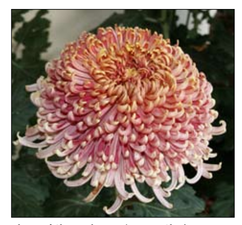
Flower of Chrysanthemum 'Evening Glow'.

Last year to mark the Japanese Chrysanthemum Festival the Museum held a Chrysanthemum Moon exhibit of chrysanthemum stones, autumn kusamono and related art work, along with a modest display of specimen chrysanthemums.