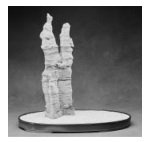
Penjing Mountain Stone

ing stones. These postcards will be available for purchase at the U.S. National Arboretum. The next step will be to develop a book on the viewing stones, which Jim estimates will have 50–60 pages and be available in both hard- and soft-cover editions.