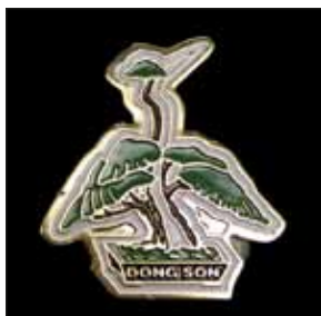
Pin from Vietnam.