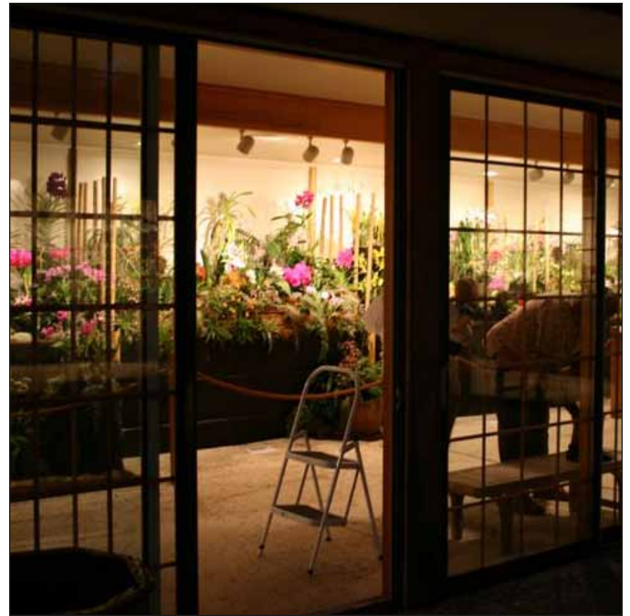
Night set-up for Orchid Show.