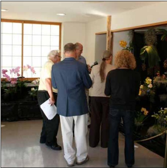
Judging the Orchid Show.