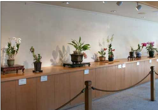
Chinese Scholar Orchid Exhibit.