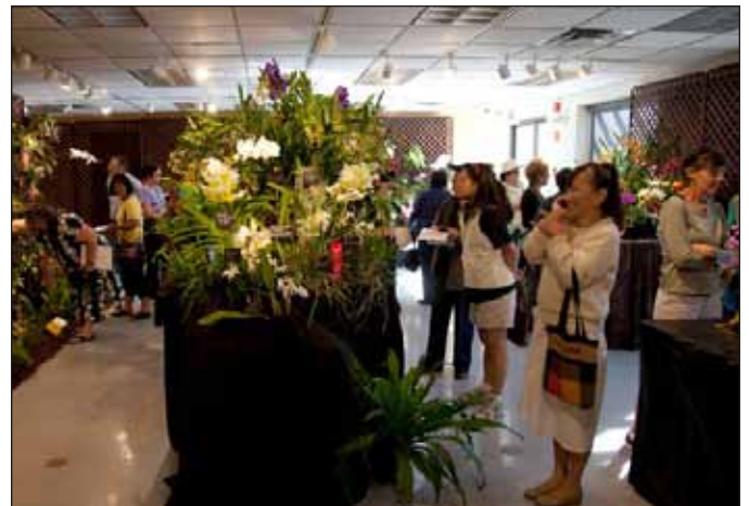
Orchids on Display.