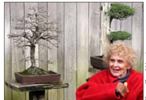
Gloria Stuart at the Huntington Library and Gardens with her cork bark elm.

In 2005 Ms. Stuart attended the World Bonsai Friendship Federation convention in Washington D.C. and was an honored guest at the Museum banquet held at the National Arboretum.