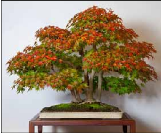
Maple in the Fall Exhibit.