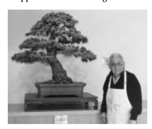
A $2.95 Purchase!

On the final afternoon of John's trip, a storm approached. The temperature dropped more than 20 degrees in one