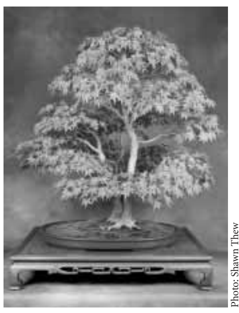
Acer palmatum, gift of the late Japanese Prime Minister Keizo Obuchi

The tree that so captivated me, Acer palmatum (Japanese maple) was donated by the late Japanese Prime Minister Keizo Obuchi. Received in 1999,