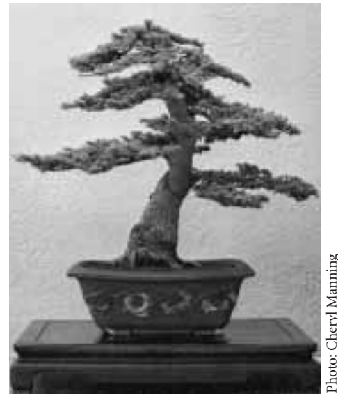
Cedrus atlantica, Blue Atlas cedar named "Gimpo"

branches will develop, and scars will heal faster. But to develop the quality of hidden beauty (Shibui), the tree needs to grow more slowly in a pot. This is also the time to do detail work and