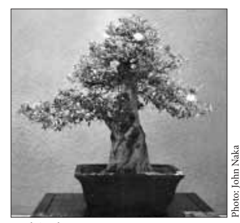
Purloined Pomegranate: 1972

In 1960, California was building the Golden State Freeway. Thousands of homes needed to be removed before the ribbon of asphalt was laid. And all of that lovely landscaping surrounding these houses would end up in a landfill. But not if John Naka could help it.