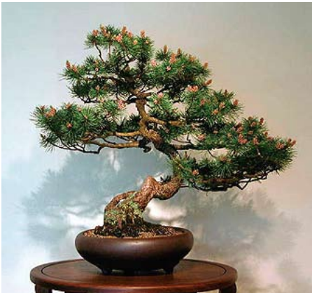
White Pine, Pinus parviflora , Informal style – 58 years in training.