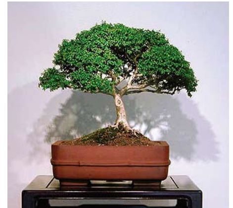
Kingsville Boxwood, Buxus microphylla 'Compacta', Informal broom style – 18 years in training from cutting.