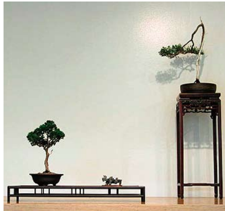
Shimpaku Juniper (right), Juniperus chinensis var. sargentii , Literati style – 16 years in training.