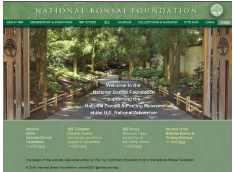
The home page of the newly redesigned NBF website.

The toolbar on the home page is divided into two sections. Information about NBF is on the left hand side of the bar and the right side highlights the Museum and the collections. The Museum pages will change on a regular