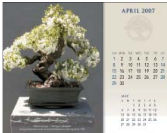
Sample page, 2007 NBF Calendar.

NBF has published a small Museum desk calendar for 2007. Since this is our first effort to do our own calendar, we have printed only a limited number. If these sell well this year we will print more copies in future years.