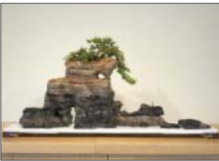
Penjing landscape "Autumn Winds", Wucui Lingbi Stone, Anhui Province, China